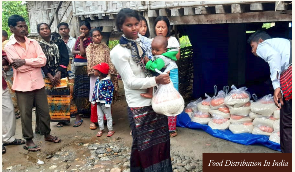
Food Distribution In India

Our ministry focuses on going as Jesus went, seeing as Jesus saw, feeling as Jesus felt, and doing as Jesus did according to Matt. 9:35-38 in order to reach the unreached and to train them to reach their own people and villages. In 2020 because of the lockdown, we could not go out and preach the gospel in the villages. But God opened doors for our ministry to reach 1,359 non-Christian families with food supplies along with one Holy Bible each. Later on when the lockdown was relaxed, our people were able to follow up each of the families and present the gospel. Seven hundred lost souls received Jesus as their personal Savior, and seven new churches were planted. Students come from Bhutan, Nepal, Myanmar, and throughout India.