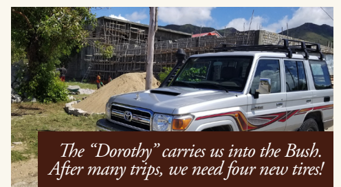
The "Dorothy" carries us into the Bush. After many trips, we need four new tires!

6,000 PEOPLE HEARD THE GOSPEL 12 BAPTISMS 256 PROFESSIONS OF FAITH 12,000 HUNGRY PEOPLE FED