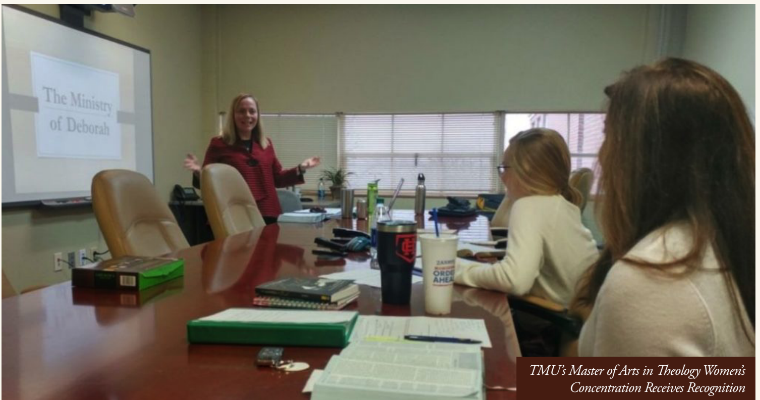
TMU's Master of Arts in Theology Women's Concentration Receives Recognition