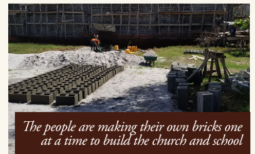
The people are making their own bricks one at a time to build the church and school

all we need for the 2021-2022 school year beginning in August.